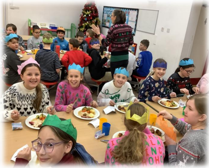
Governors served the children... Thank you!