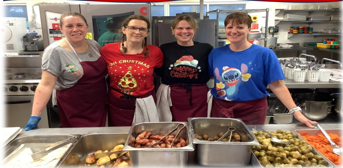
Food Donations Collected for Shekinah Mission!